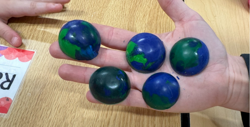
Earth Day at Valley Early Childhood School